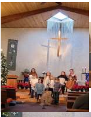
Children's Christmas Message December 19