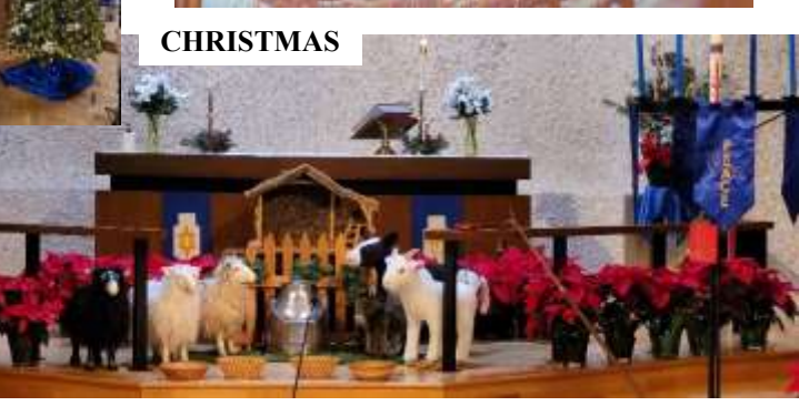
We continue to look for pictures of the people and events of Grace. Please send your pictures to Pastor Kate and/or the church office email.